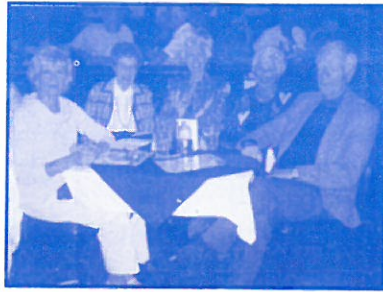
Yalies and friends enjoying a performance of "Cabaret"